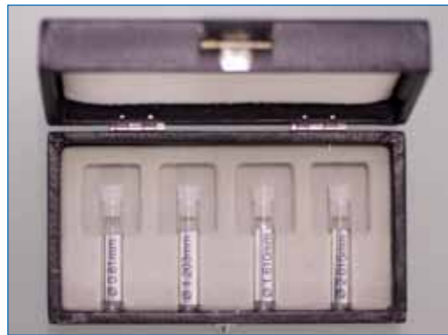
Calibration standard DCS-SVT