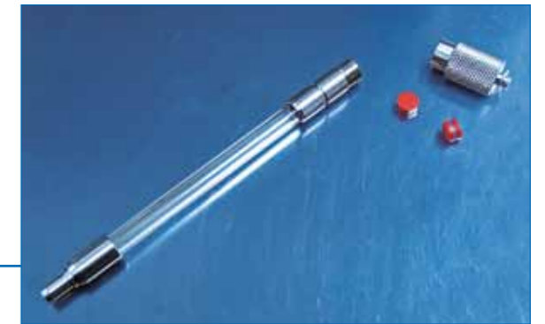
Fast exchange capillary FEC 622/400-HT