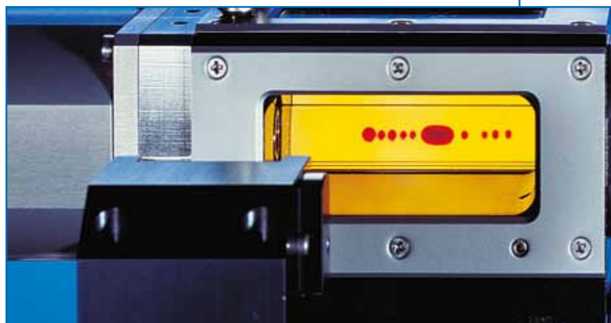
Spinning drops in SVT 15N capillary